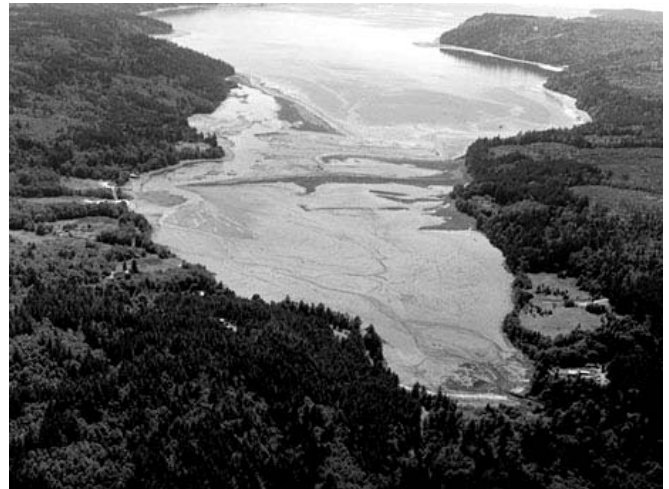
Tarboo-Dabob Bay. This view is looking south, with Shine to the left and Quilcene to the right.

1. DNR land within the boundary would be transferred from "trust status" (subject to timber harvest) to "protected status" (no timber harvest). This would both preserve wildlife habitat and protect the bay's aquaculture (oysters) from siltation that can follow logging in inappropriate areas.