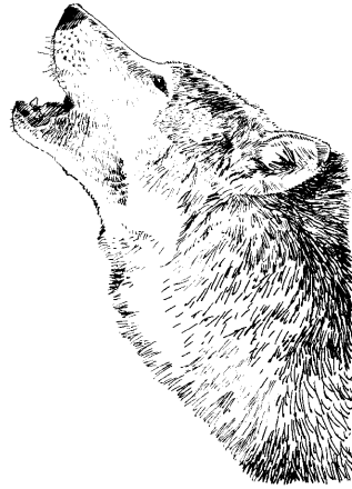
- Larry Eifert

For example, OCNMS has some of the world's rare and vulnerable deep-sea corals, which are damaged by fishing gear despite the sanctuary's mandate to prohibit seabed alteration. We need to encourage the sanctuary to protect the ecosystem comprehensively against multiple impacts.