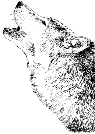
- Larry Eifert

For example, OCNMS has some of the world's rare and vulnerable deep-sea corals, which are damaged by fishing gear despite the sanctuary's mandate to prohibit seabed alteration. We need to encourage the sanctuary to protect the ecosystem comprehensively against multiple impacts.