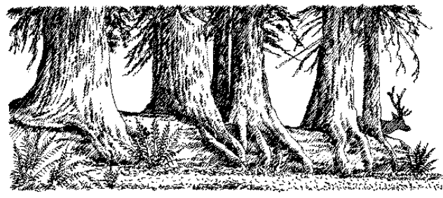
– Larry Eifert

OFCO requested the analysis documents on murrelets developed by WDFW. The final plan for the Hood Canal zone will be published in December 2016. There are <u>Geographic Response Plans</u> for sensitive waters of Washington, which also may be vague on the issue of endangered species protections.