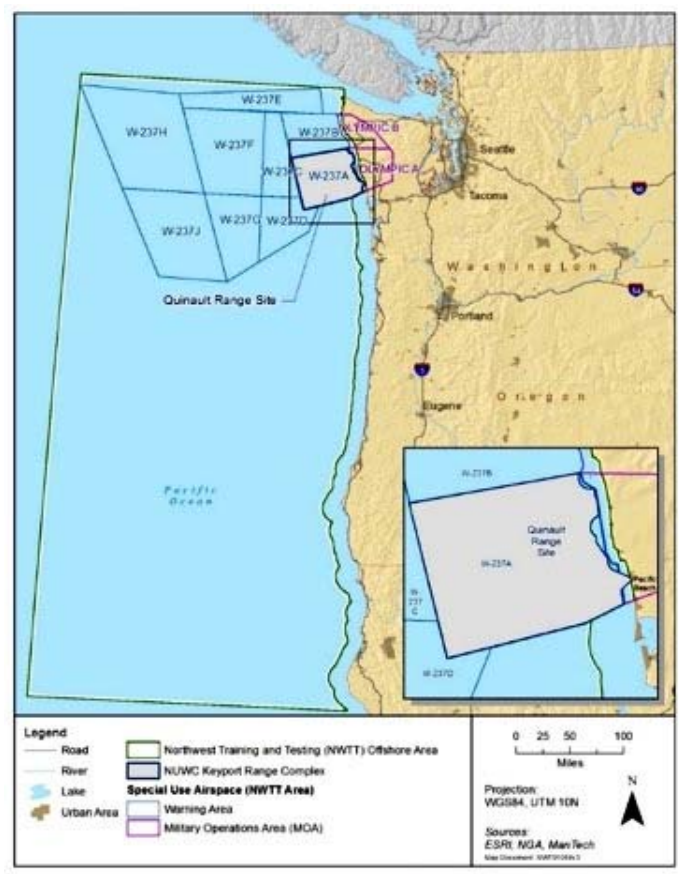
Figure 2. The Navy's Northwest Training and Testing Offshore Area, part of the action area that includes the northern Pacific Ocean from the Washington coast to the Aleutian Islands of Alaska.

The Navy's process has been fraught with inadequate public disclosure, misinformation, incorrect scientific analysis, and serious gaps in data and information. Sullivan questions the increased area the Navy claims for its electronic warfare testing range without public input, and the impacts of warfare maneuvers on wildlife and livelihoods in communities around the Olympic Peninsula forests, San Juan Islands and coastal and offshore waters in the Salish Sea and Pacific Ocean. Planned Naval war activities overlap with a National Wildlife Refuge, Olympic National Park, and the Olympic Coast National Marine Sanctuary, as well as tribal lands, including important traditional sites.