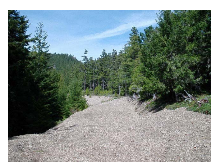
Forest Service Road 2875 above Slab Camp after decommissioning project, successfully re-wilding the Gray Wolf River valley.

Have we enabled users to show "more respect for the resource," as called for in OFCO's mission?