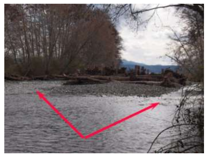
This ELJ is in the middle of the river. Since I took this photo in March, I can't figure how the salmon can make redds when the water level is much lower later in the year.

Each phase of the plan has worksites set in five different areas (or "reaches") of the middle Dose, from River Mile (RM) 6 to 10. Plans are set for 16 log jams.