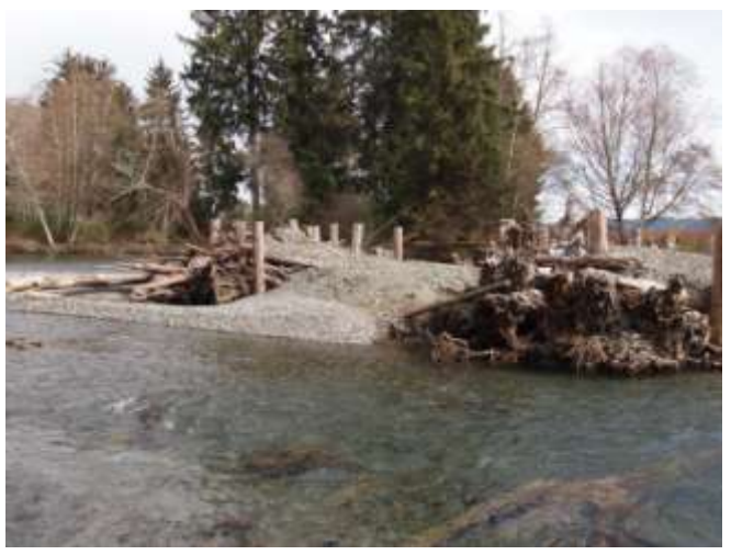
Tons of gravel were used to form this island.