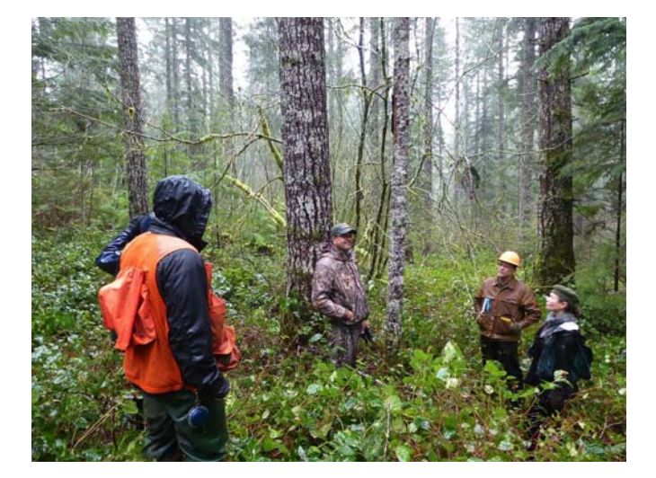
Field visit group discussion of unit. Big Creek, April 2017

The group identified a few possible Stewardship projects, and developed ideas for the sale "prescriptions"—the timber-harvesting instructions to foresters. OFCO contractor Jill Silver pointed out where streams were incorrectly mapped. OFCO will work to make sure that all water resources are well protected.