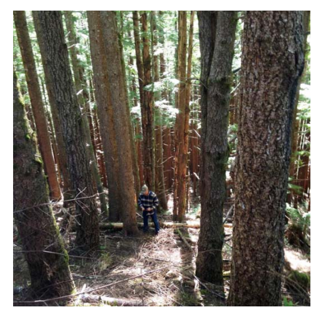
Queets Stand Density Analysis (2016). Note the lack of understory, brown forest floor, lack of life and thin species. Thinning could help this site.

allowed them to explore mutual needs and possibilities. ... Both the Forest and Collaborative are also interested in exploring Stewardship timber sales that would allow generated revenues to be reinvested into other environmental protection and restoration projects. This would be an added bonus of the Collaborative's efforts. Ultimately, when we have collaboratives, better projects are designed, there's less conflict, and we're able to implement actions on the ground that produce multiple benefits."