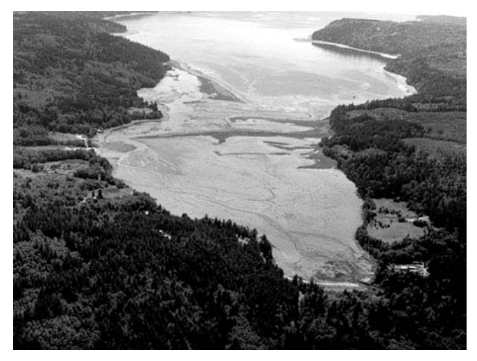
Tarboo–Dabob Bay. This view is looking south, with Shine to the left and Quilcene to the right.

1. DNR land within the boundary would be transferred from "trust status" (subject to timber harvest) to "protected status" (no timber harvest). This would both preserve wildlife habitat and protect the bay's aquaculture (oysters) from siltation that can follow logging in inappropriate areas.